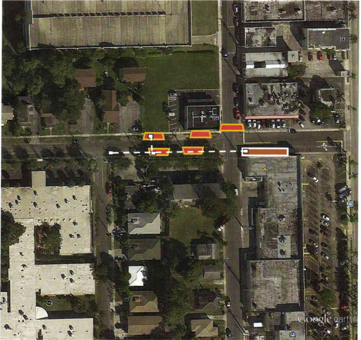
NW 1 st St – Moe Udell St (1 crosswalk, 5 areas of pavers with catch basins with no bottom in them with 18" RCP